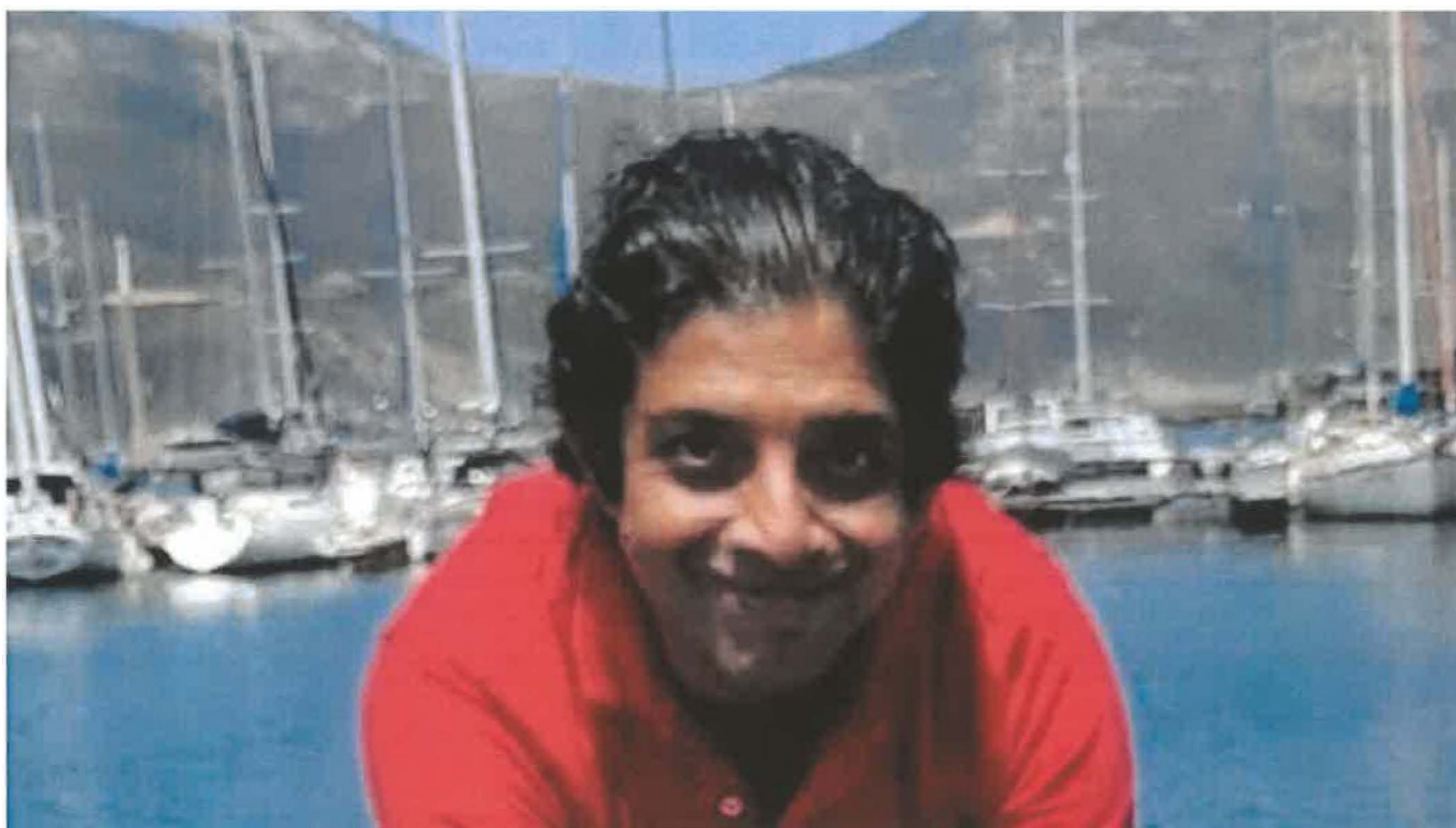
Rituparno Goswami.

New members are elected each year by the full existing membership. Membership in the academy is a great honour and is in recognition of scholarly achievement. Members are the core asset of the academy and give their time and expertise voluntarily in the service of society.